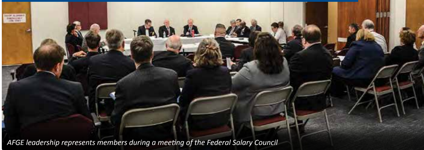
AFGE leadership represents members during a meeting of the Federal Salary Council

F ederal employees and retirees will see their wages and benefits rise in January, but those gains are offset by years of cuts and higher costs for health care and other expenses.