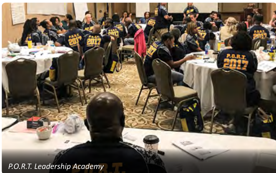
P.O.R.T. Leadership Academy

Attendees enjoyed a graduation banquet at the end of the week, highlighted by the AFGE Y.O.U.N.G. Committee's efforts to raise money for those dealing with the devastation from recent hurricanes. The campaign raised more than $47,000 for the AFGE Disaster Relief Fund.