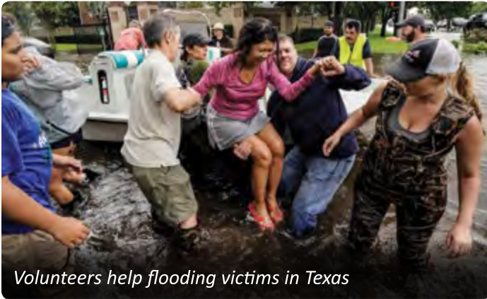
Volunteers help flooding victims in Texas

A s summer drew to a close, tens of thousands of federal workers responded to the trio of hurricanes that caused catastrophic damage and loss of life across large sections of the country.