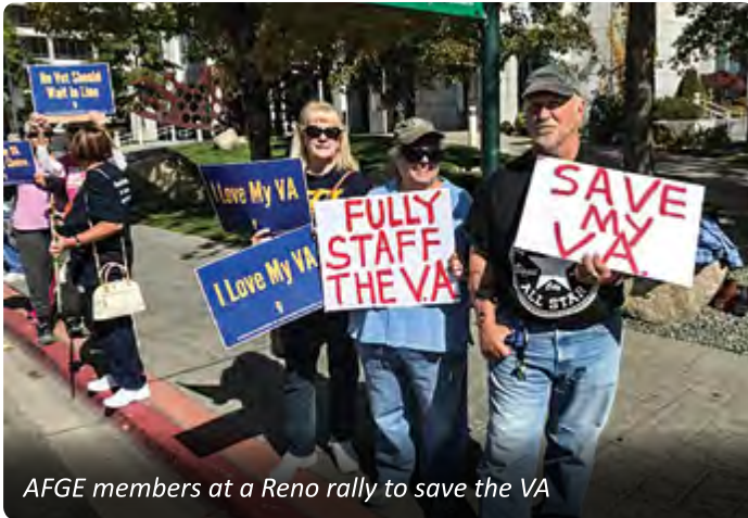
AFGE members at a Reno rally to save the VA

It's been three months since the President signed the Accountability and Whistleblower Protection Act of 2017 into law. The bill was pitched to Congress by Sen. Marco Rubio of Florida as a new piece of legislation that removed bad actors from the VA, while protecting whistleblowers on the job. In reality, it's no more than a firing bill that can be used to silence whistleblowers.